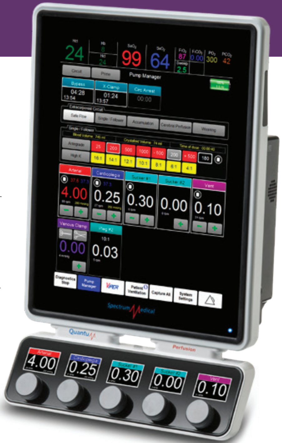
15" Quantum Workstation with optional Pump Control Module