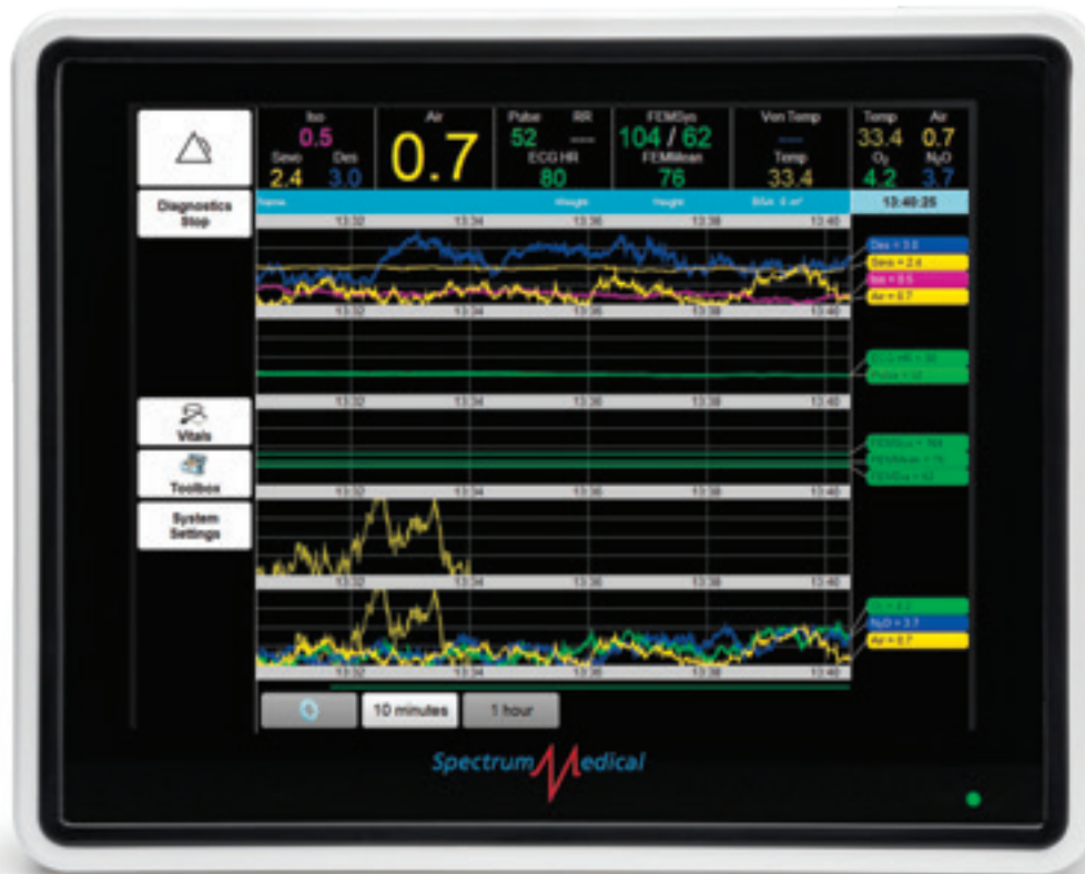
12" Quantum Workstation

The window to intuitive control of the most advanced and safest perfusion technology available.