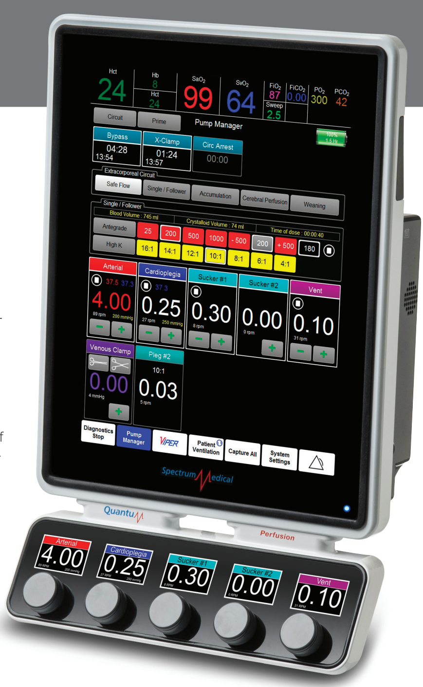
15" Quantum Workstation with optional Pump Control Module