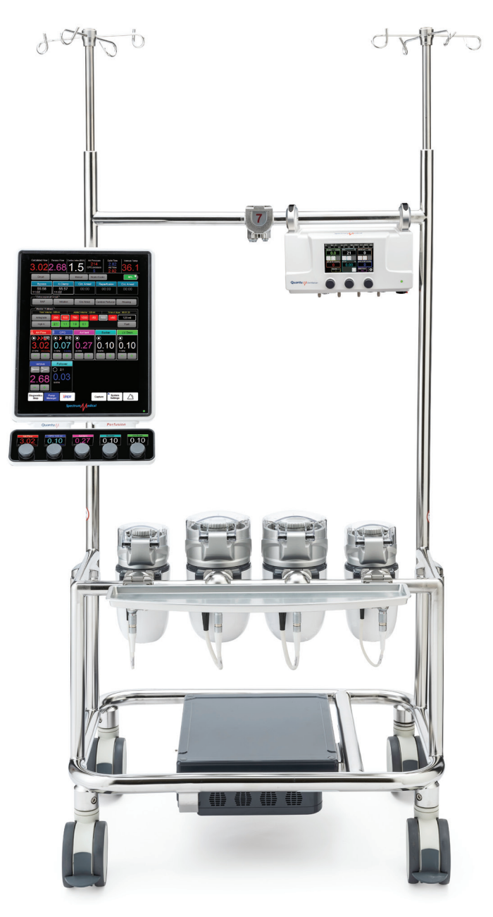
The New York HLM Frame